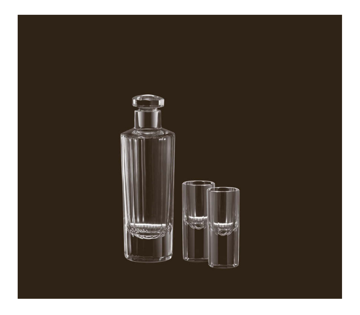
Drinking set no.272 - "Wersin"